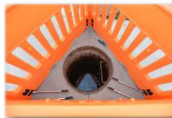
Protect Pedestrians From Work Zone Hazards