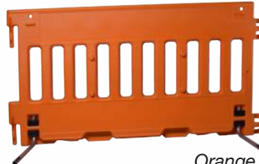
57000-AO Orange ADA Pedestrian Wall