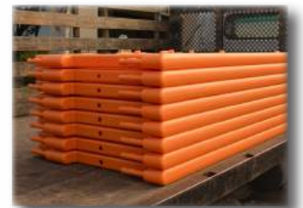
Four Molded-In Stacking Lugs for Secure Transport and Storage.