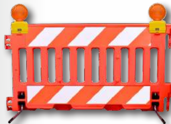
Locations for Two Barricade Lights and Recessed Areas for Reflective Sheeting