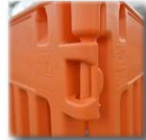
Blow Molded Connectors Provide Strength and Flexibility.