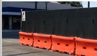
Fence can be Screened for Greater Security