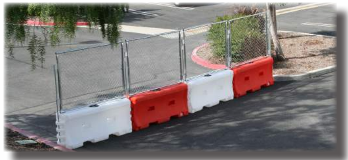
Ideal for vertical construction. Secure and easy to deploy.