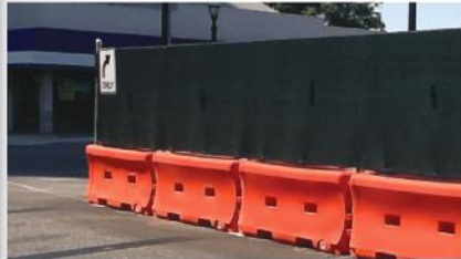
Fence can be Screened for Greater Security