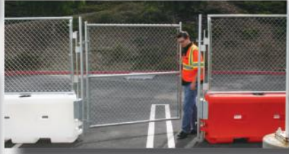
Secure entry with a 6' Single Gate