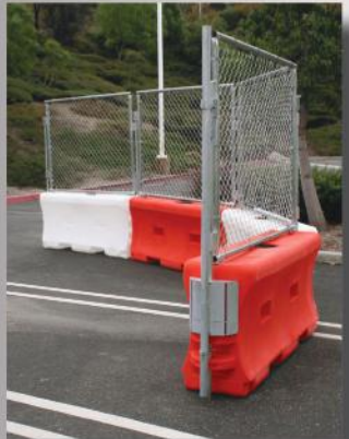
Water-Wall Fence Rotates up to 30° Degrees

The chain link fence will attach to the top of a longitudinal barrier, (TrafFix Water-Wall™), creating additional security to a work zone. The mesh fence will be made of 11 gauge steel, connected to vertical steel posts of 1 5/8" diameter. Fence sections will be 6' wide x 4' tall. Each fence section shall weigh no more than 42 lbs including the connector T-pin. Each T-pin will extend down through the sections of fence into the knuckles of the TrafFix Water-Wall to securely connect the fence to the wall. Each T-pin shall have a hole at the upper end for a security bolt to enhance security. The fence will accommodate a 6' single gate or a 12' double gate for entrance or exit from the work zone. For maximum stability, the TrafFix Water-Wall, filled with water will weigh 1,110 pounds. Overall height of the Water-Wall Fence attached to the top of the TrafFix Water-Wall will be a minimum 84".