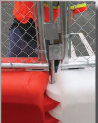
T-Pin Connects Wall to Wall and Fence to Fence