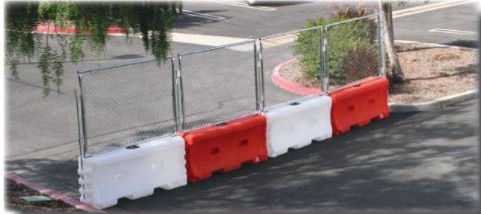
Ideal for vertical construction. Secure and easy to deploy.