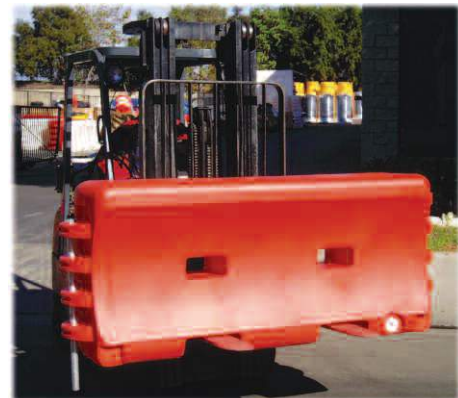
Water-Wall can be easily lifted and placed using a forklift or pallet jack.