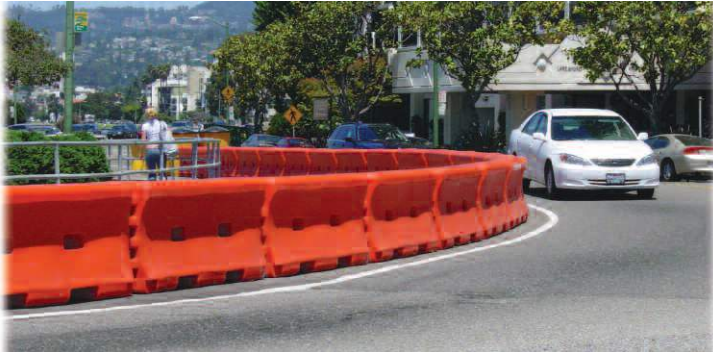
30-degree pivoting hinge design allows the TrafFix Water-Wall to handle curved roads.