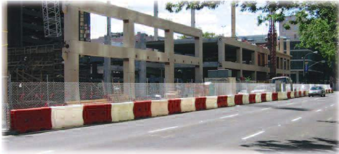
The TrafFix Water-Wall used as a Longitudinal Barricade along a job site.