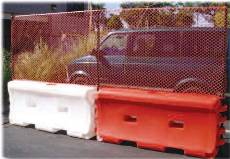
Water-Wall with extended connection pins and plastic fence.