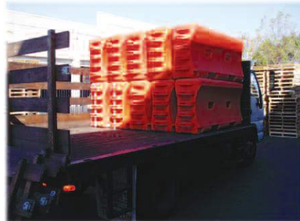
Water-Wall stacks for storage and transportation.