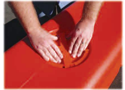
Large 8" fill hole speeds filling process, includes twist-lock plastic cap.