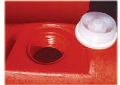
New tamper resistant, corner offset drain plug with coarse buttress thread — screws in or out in only 2 1/2 turns.