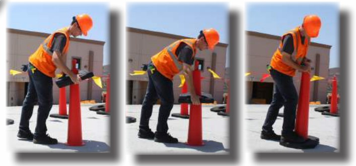
Drop over base for easy set-up