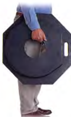
Worker using center carrying hole with 40-lb. base

TraFFix 100% recycled rubber base is the "sandless" way to ballast channelizer drums. The rubber base "grips the road" and minimizes drum movement due to wind gusts. Rubber bases come in 40 and 25 pound weights with two convenient carrying methods.