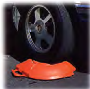
Automobile running over a San-Fil base

San-Fil bases are designed to hold approximately 50 pounds of sand. The twist lock cover keeps the sand inside the base. Two carrying handles make movement and placement an easy job. The low profile 4" high base easily clears vehicle undercarriages and can even support the weight of any vehicle.