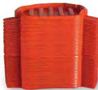
25 standard bases nest for shipment and storage

Economical and easy to use - simply place the base on the ground, add a sand bag and snap - lock the drum top to the base. Made of durable, impact resistant polyethylene.