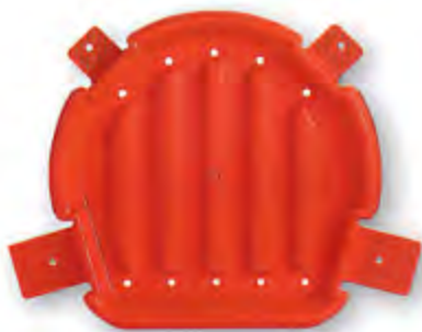
Standard Base (requires sand bag)

We have the solution. Traffix Devices offers the largest selection of channelizer drum bases in the industry. Choose from an array of different types and styles that best fit your needs and budget. And remember, whichever base you select, it will fit any Traffix channelizer drum top, even the ones you may have purchased years ago.