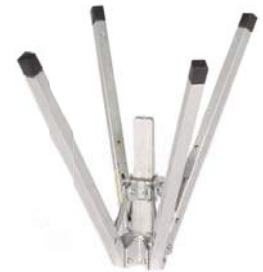
All four legs drop at the same time