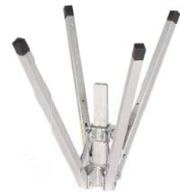
All four legs drop at the same time