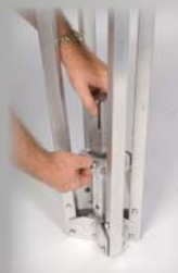
Quick Release Pin