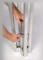
Quick Release Pin