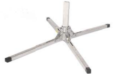
Deployed and ready for a roll up sign