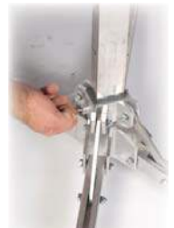
Pull Pin to Close Stand