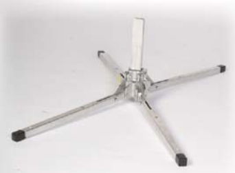
Four Legs Deployed and in Position