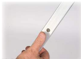
Push Pin Telescoping Legs